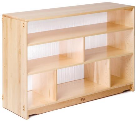
Translucent Shelves 32”h - $560

All shelving units have on/off mobility with hidden wheels for mobility and to lock in place for a stationary shelf.