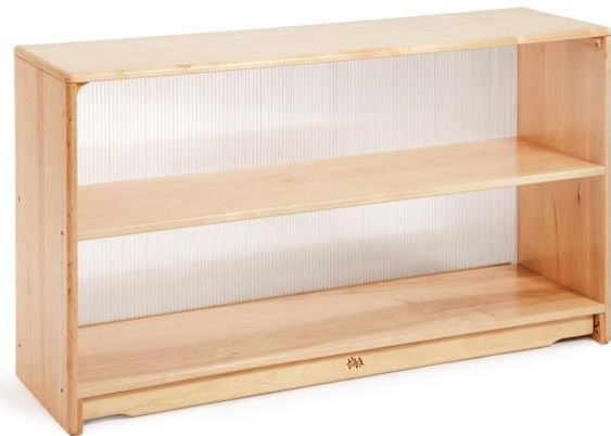
Translucent One Shelf 24”h $455