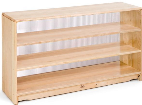
Translucent Two Shelves 32”h - $515