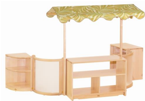
Play Store Set $1,480; Play Store only $485

THIS KITCHEN SET HAS BEEN PURCHASED, THANKS TO THE DONEGAN FAMILY