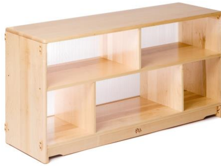
Translucent Shelf 24”h $455